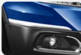
Bumper Corner Protector Chrome