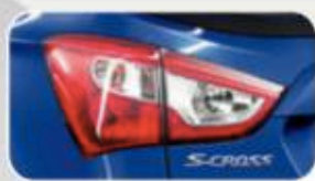
Rear Combination Lamp