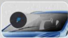
Auto Rain Sensor