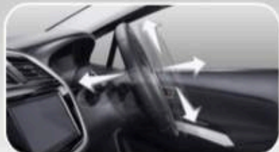
Tilt & Telescopic Steering

Head Unit 7 Inch Touch Screen with Smartphone & Bluetooth Connection, Dual USB Port and HDMI Port Cable, Mirroring to Smartphone with Black Piano Color Panel Instrument