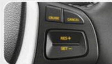
Cruise Control (M/T & A/T)