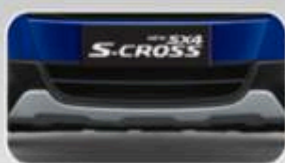
Front Skid Plate with Silver Accent