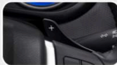
Paddle Shift (Only A/T)