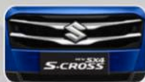
Sporty Chrome Grille