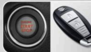
Engine START/STOP Push Button & Keyless Entry