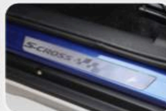
Door Sill Guard