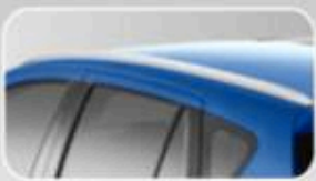
Stainless Roof Rails