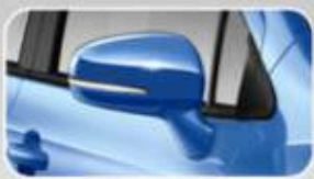
Aerodynamic Wing Mirror Design + Turn Signal Lamp (Electric Mirror & Electric Foldable)