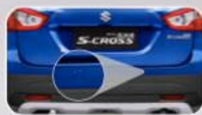
Rear Parking Sensor (4 points)