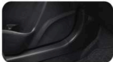
Four Point Speakers