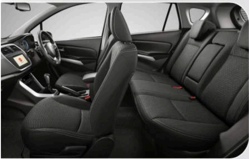
Spacious Interior with Comfortable Seats

Langkahkan kaki ke dalam New SX4 S-CROSS dan rasakan sentuhan seni di dalamnya. Dibalut bahan berkualitas serta berbagai fitur lainnya yang membuat penjelajahan Anda semakin nyaman.