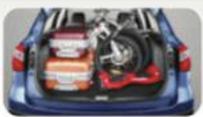
Luggage Capacity (430 Lt)