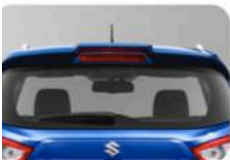
Rear Upper Spoiler

Jadikan New SX4 S-CROSS semakin atraktif dan serbaguna dengan pilihan aksesoris yang dibuat khusus untuk melengkapi kebutuhan selama perjalanan