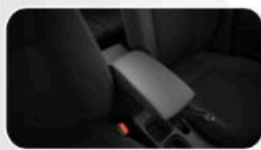
Front Center Armrest