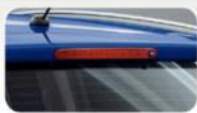
High Mount Stop Lamp