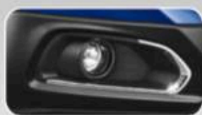
Chrome Bezel Fog Lamp