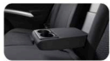
2nd Row Armrest