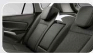
Adjustable Rear Seatback