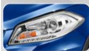
HID Projector Headlamp with LED + Auto Headlight On & Leveling Feature

Dirancang dengan kemampuan manuver istimewa, New SX4 S-CROSS didesain untuk menaklukkan berbagai medan serta kondisi jalanan dengan penampilannya yang karismatik.