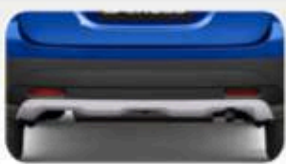
Rear Skid Plate with Silver Accent