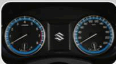
Meter Cluster with Multi Information Display