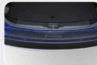
Rear Bumper Scuff Plate