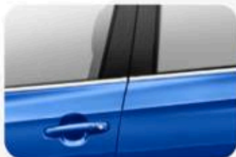
Window Garnish Chrome