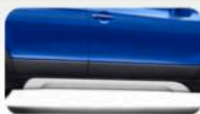
Side Skid Plate With Silver Accent