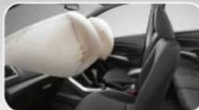
Dual SRS AIRBAG (Impact Sensor)