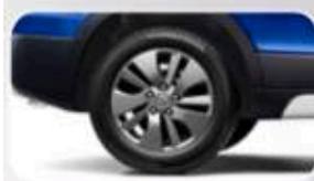
Sporty Alloy Wheel (205/60 R16) Warna : Gun Grey Metallic