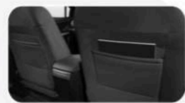
Front Seatback Pocket