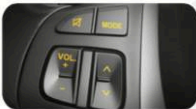
Audio Switch Control